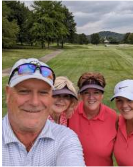
Lakewood represented at The TPGA Pro-Lady Tournament.