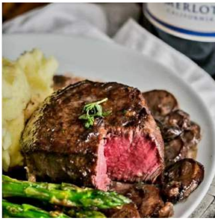
Steak Night Every Friday Check Facebook or Instagram for our “Cut of the Week” and sides