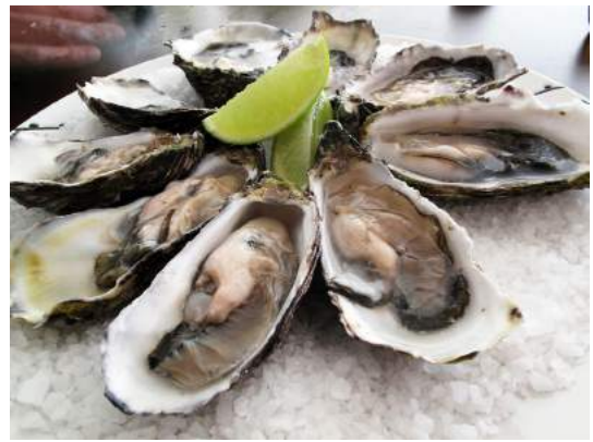
Fresh – Never Frozen Oysters on the Half Shell We will have 10 dozen available every weekend, So reserve yours before they’re gone! (If you would like more for a party, we need 1 week advance notice)