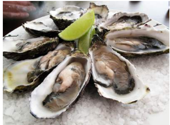
Fresh - Never Frozen Oysters on the Half Shell

Check Facebook or Instagram for our "Cut of the Week" and sides