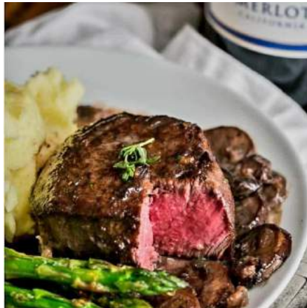
Steak Night Every Friday