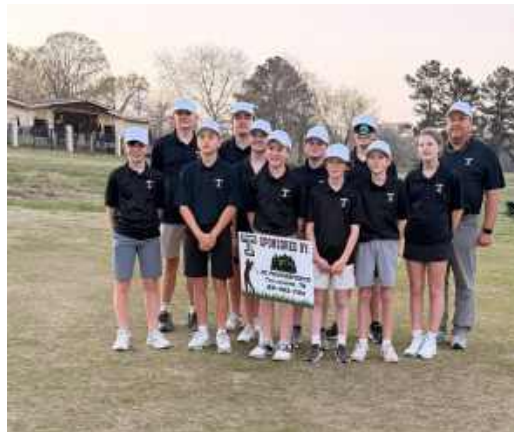
2026 TMS GOLF TEAM