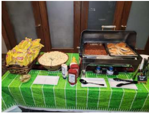
Super Bowl Sunday