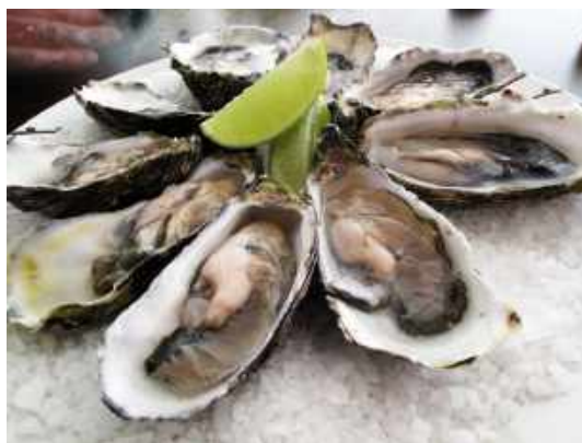
Fresh – Never Frozen Oysters on the Half Shell We will have 10 dozen available every weekend, So reserve yours before they’re gone! (If you would like more for a party, we need 1 week advance notice)

Our first of what we hope are many Wine Dinners