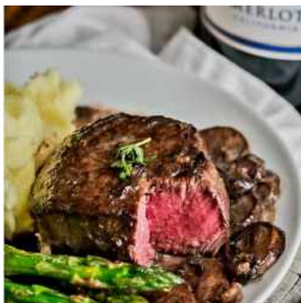
Steak Night Every Friday Check Facebook or Instagram for our “Cut of the Week” and sides