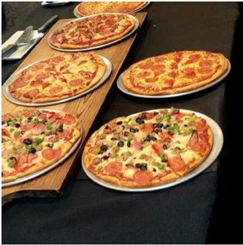
Courtside Home Owners Association Meeting